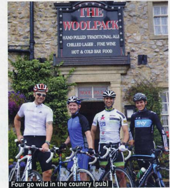
Four go wild in the country (pub)

After he began suffering with mysterious back pain in 2008,