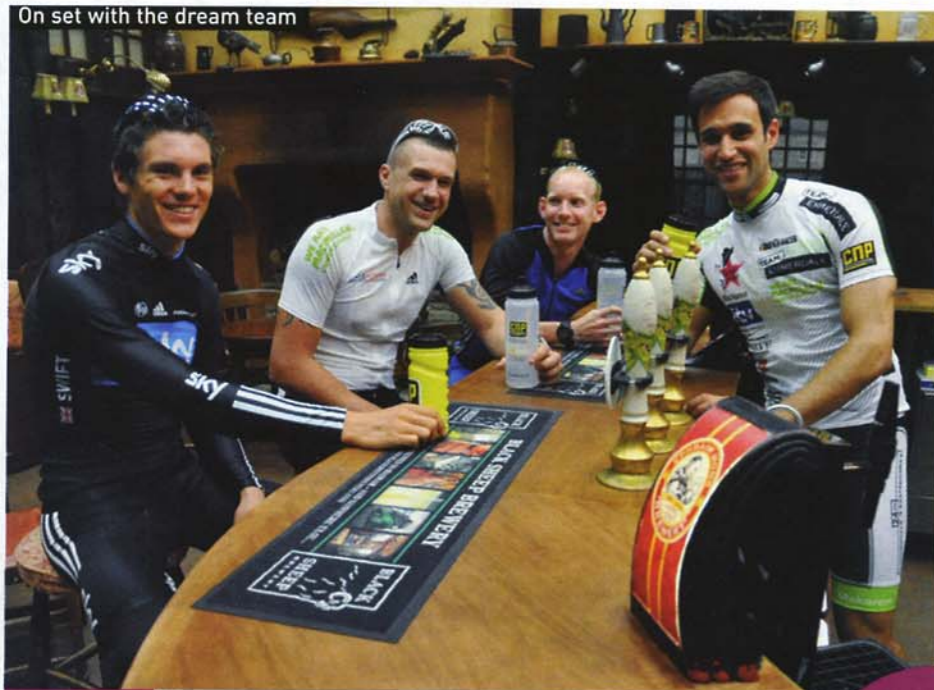
On set with the dream team

"The inside of the Woolpack you see on TV is in Leeds"