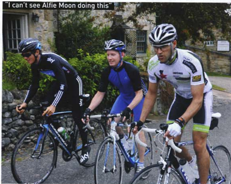
"I can't see Alfie Moon doing this"

The roads here are quite busy, although as this ride proves, there are plenty of lanes away from the main traffic arteries. They require a little bit of local knowledge, but there's a huge cycling resource on www.leeds.gov.uk . Access it by clicking on 'transport' then 'cycling and walking'. The area is blessed with lots of brilliant cycle-ways, suitable for short family rides or long-distance treks into the Yorkshire Dales or over the Pennines and into Lancashire.